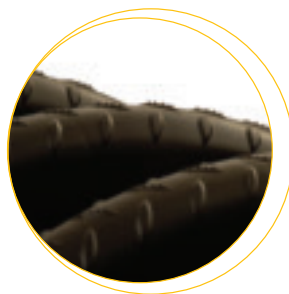
Diamond Plate Texture