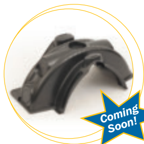
Side Port Coupler