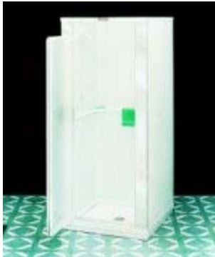
Photo features optional shower door