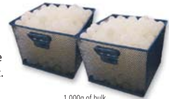
1,000g of bulk waste material

Gerber has created the most advanced technology equipping the Avalanche toilet with the strongest, most powerful flush in its category. With an enlarged 3" flush valve and superior hydraulics, the exclusive XP3™ measurably outperforms the competition, delivering exceptional performance from a gravity-fed toilet. According to independent test results, the Avalanche flushes 1,000g of bulk waste. It's all the power and performance you could ask for in one low-maintenance, quiet machine.