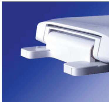
Factory-installed "living" hinge covers