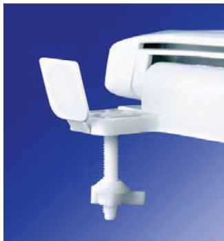
Corrosion proof, self-aligning hardware