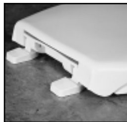
"LOCKED-IN" TOP-TITE® HINGE

Ring thickness is 13/16" Ring thickness including the bumper is 1-1/16" Height of the seat with cover is 2-5/16"