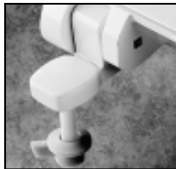
TOP-TITE® HINGES FEATURE NO-SLIP WASHER