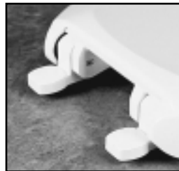
"LOCKED-IN" TOP-TITE® HINGE