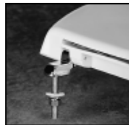
300 SERIES STAINLESS STEEL SELF-SUSTAINING HINGE