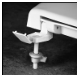
TOP-TITE® HINGES FEATURE NO-SLIP WASHER

Ring thickness is 3/4" Ring thickness including the bumper is 1-1/16" Height of the seat with cover is 2-1/4"