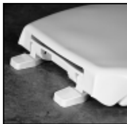
"LOCKED-IN" TOP-TITE® HINGE